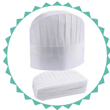
Disposable Chef Cap