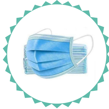
3 Ply Masks