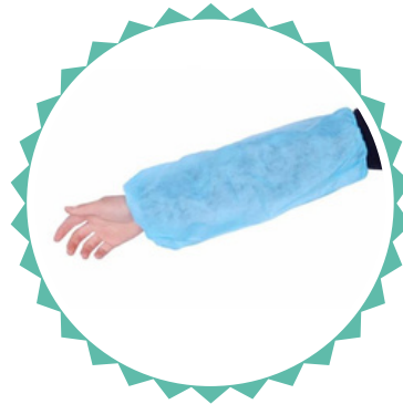
Non Woven Sleeves