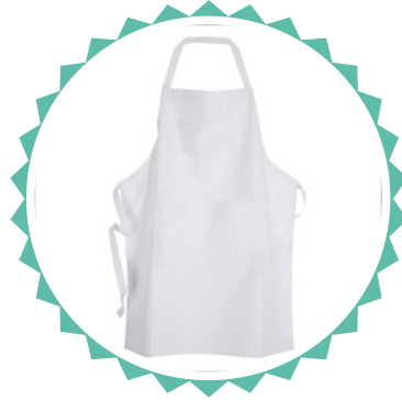
Kitchen & Salon Apron