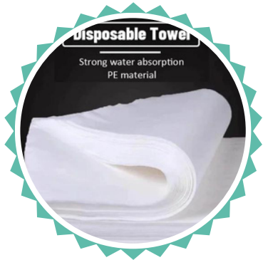
Disposable Napkin & Towels