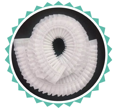
Biodegradable Shower Cap