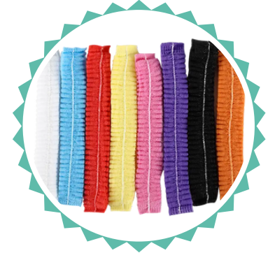
Disposable Bouffant Caps