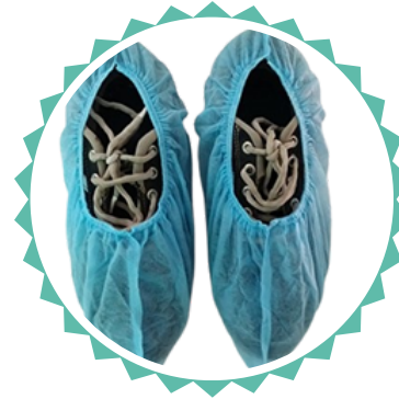
Non Woven Shoe Cover