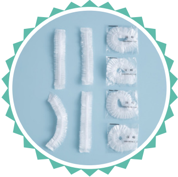
Disposable Shower Cap