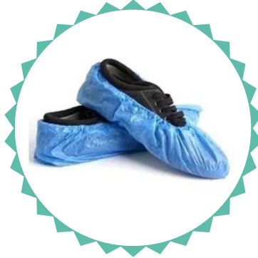
Plastic Shoe Cover