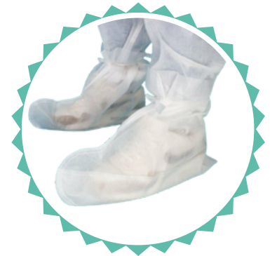
Knee Length Shoe Cover