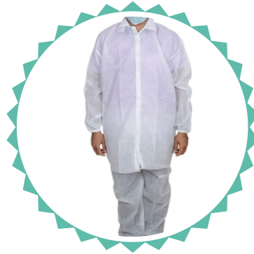
Non Woven Surgical Pant Shirt