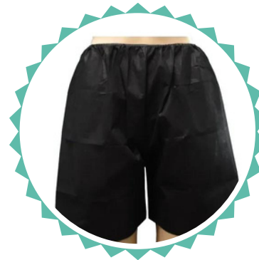
Disposable Briefs & Bermuda